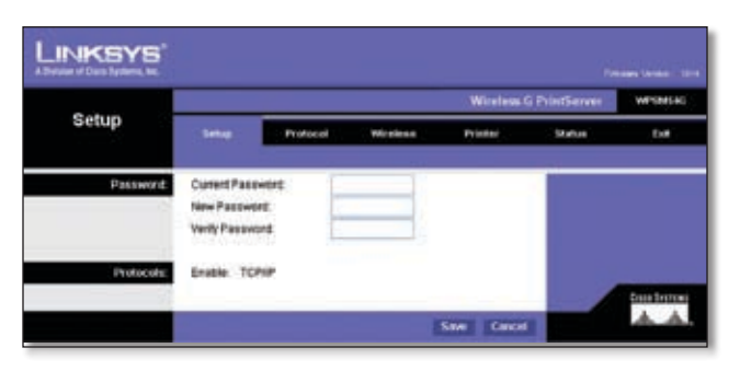
Setup > Setup

The first screen that appears is the Setup tab and allows you to change the PrintServer's general settings.